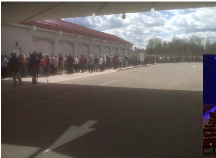
Casino New Brunswick Opening Day Line-up "Not to be confused with ABSDA Show Registration"