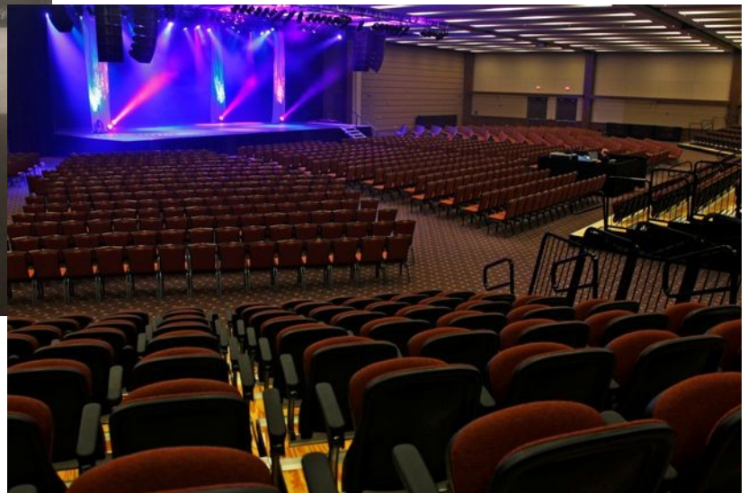
Casino New Brunswick Entertainment Centre