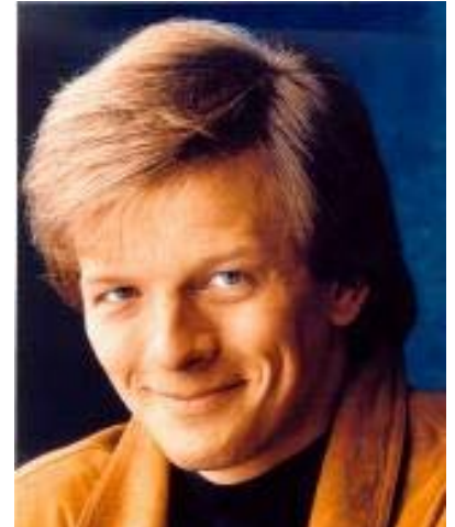
André-Philippe Gagnon Thursday, February 24, 2011